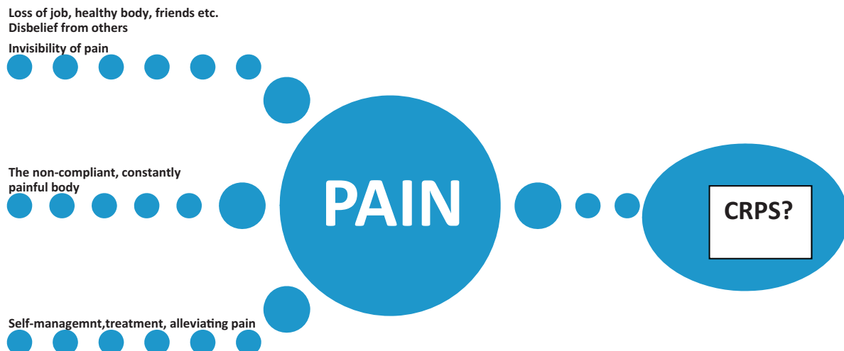
Fig. 1. Dealing with chronic pain. Where does CRPS fit?

The 14 women in the study conducted by Juuso et al. [41] 9 women in the study by Juuso et al. [27] and 15 men in the study by Paulson et al. [42] were met by society (including family, friends, and co-workers) with disbelief and were not taken seriously. As a consequence, these people with fibromyalgia struggled to cope with every day activities and felt their credibility was in question. Women reported that they did not accept pain but had learned to live with it, pursuing everyday day life as best as they could under their new life conditions [27,41]. Men acquired self-acceptance and