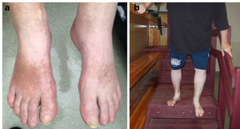
Fig. 2 Case 1. Certain symptoms are attenuated following treatment with low-dose naltrexone (LDN) in a long-standing case of CRPS (6 years after onset). a Allodynia is greatly reduced in both legs after LDN. However, bilateral trophic changes remain in the lower extremities. Slight swelling is present in the distal portion of the right foot.

In June 2011, the patient was started on low dose naltrexone (LDN) of 3 mg once a day and ketamine troches (sublingual) 10 mg on as needed basis. The LDN was increased to 4.5 mg per day, 4 weeks after starting it. LDN was started as a lower dose to gauge tolerability. She tolerated the LDN very well with