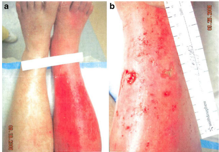
Fig. 1 Advanced CRPS symptoms in Case 1. 4.5 years after onset of the disorder. a Allodynia and pronounced vasomotor dysfunction are present in the lower right extremity (photo taken 9/18/2008). b One week later, the leg has developed numerous ulcerations

and anti-cardiolipin antibodies. As a result of her EDS, the patient has had repeated dislocations of her right shoulder, as well as her right ankle. The patient first developed CRPS in her lower right extremity in 2008. In 2009, the patient developed dystonic muscle spasms in the upper extremities, which were interpreted by her physicians as evidence of a conversion disorder.