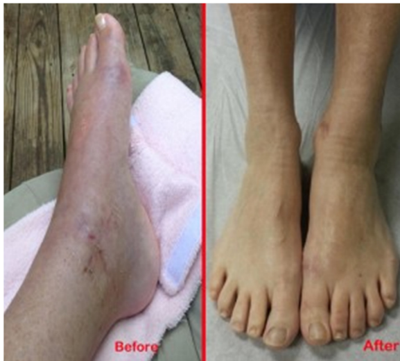
Figure 2. photo before and after intervention.

At two week follow up trophic skin changes already showed signs of lessening. The patient had also begun to weight bear on the left leg and reported less allodynia. By the time the 30 day PRP booster was performed she was no longer using adaptive aids to walk however compensatory gait persisted. Six weeks after the stem cell procedure trophic skin changes, sudo and vasomotor instability, and allodynia had dramatically improved.