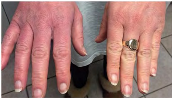
Hands of a patient with early CRPS, before atrophic changes set in.