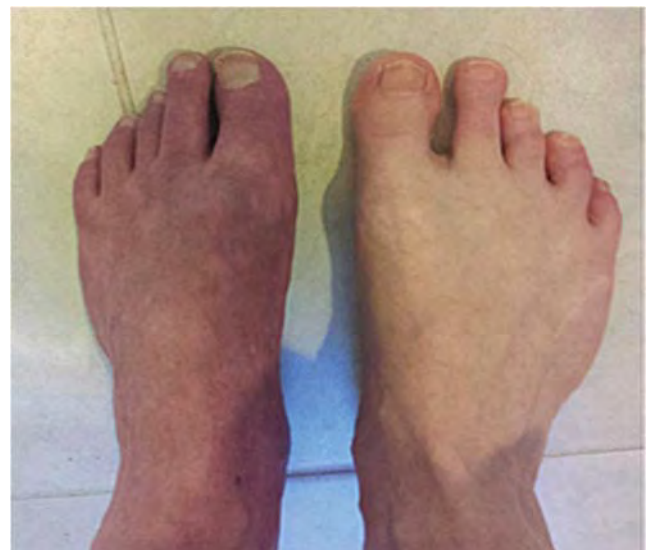
Feet of a patient with more advanced CRPS, which show clear skin atrophic changes.

Initially, the involved painful area (usually part of an extremity) becomes red, warm, and edematous; it is often initially misdiagnosed as cellulitis. The presence of severe allodynia (pain induced with a nonpainful stimulus such as light touch) should make the physician consider the true diagnosis. It is very important that CRPS be diagnosed early on because active treatment can reverse and eliminate the condition. Treatment includes neuropathic analgesics (eg, tricyclics, gabapentinoids) combined with active physiotherapy and mindfulness. Many patients who develop this condition will come to the emergency department with their painful condition when it begins, so the emergency physician needs to be able to diagnose and refer appropriately. I personally diagnose two to three new cases per year in my emergency medicine practice.