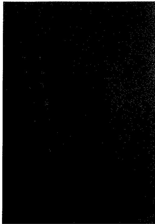
Fig. 3 Region of right foot allodynia and pattern of botulinum neurotoxin injection in a patient with posttraumatic allodynia. (Drawing by Tahere Mousavi, MD.)

OnabotulinumtoxinA was injected subcutaneously into the dorsolateral aspect of the right foot (50 U, 20 sites, grid pattern) including the region of lateral malleolus. The patient reported a 30% reduction of her pain (VAS level 7) after the first injection, and a 90% decrease after the second injection (VAS level 1–2) 6 months later; in the patient’s words, “the effect after the second injection was astounding. I stopped